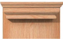
Shown in Amber Glaze

The all new 41 Living Kitchen Beacon takes living space to a whole new level. You'll feel right at home in this Beacon, which offers one full bathroom and a half bathroom, plenty of storage and counterspace in the kitchen. You'll feel like you have endless space to stretch your legs out during a long trip. We've also added additional cabinet space to the living galley, a fireplace to the bedroom suite and a half bath to accommodate whomever you happen to be entertaining.