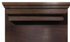
Shown in Mocha

The 42 Rear Kitchen Beacon maximizes available living space in a way that gives all the comforts of home in an innovative new floorplan. From the elevated rear Kitchen with generous counterspace to the comfortable Living Area and Bedroom Suite, this Beacon makes it look easy.