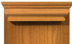
Shown in English Chestnut

The 41 Front Living Beacon makes entertaining family or friends comfortable and convenient. With the large front living area and an additional bathroom between the Bedroom Suite and the Kitchen, you can easily entertain with all the comforts of home!