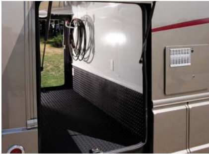
Full-basement storage along with other unique compartments keep Avanti functional as well.