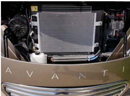
200-hp Maxx Force diesel sits on a 16,000 lb. GVWR purpose-built Workhorse W16D chassis.

Specifications, components, parts and standard/optional equipment are subject to change without notice or obligation. Product photography may show equipment that is optional. Damon Motor Coach reserves the right to make changes in prices and models and to discontinue models without notice or obligation. Components, parts or chassis may have been manufactured at times other than the model year indicated. All capacities are approximate and dimensions are nominal. All dry weights are based on standard model features and do not include optional features or equipment. Due to EPA environmental restrictions, engine power and torque ratings may change.