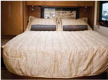
Even the bedroom conveys warmth and contemporary styling. European-inspired throughout!

©2008 Damon Motor Coach Printed in USA 9/08