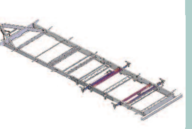
Norco NXG chassis featuring E-Coat technology