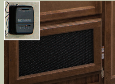
20,000 BTU Ducted furnace