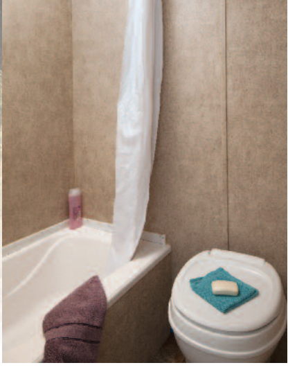
Saga 17SBH bath with roomy tub and foot flush toilet