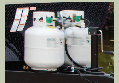
Double 20 lb. LP tanks