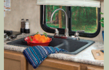
Deep, double bowl Stonecast sink with high neck faucet