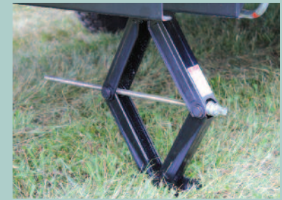
Four standard heavy duty stabilizing jacks