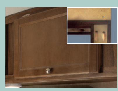
Screwed lumbercore cabinetry with hardwood mortise and tenon doors