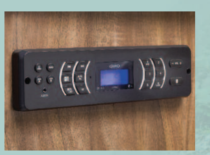
Jensen AM/FM/Bluetooth stereo with app control includes Interior/Exterior speakers