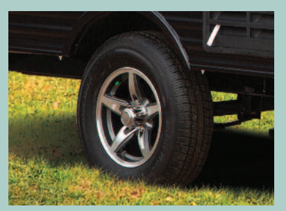
Standard radial tires. (Deluxe Package shown with upgraded aluminum wheels)