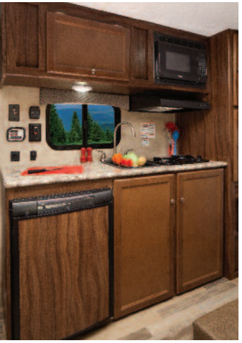
3 Cu. ft. 2-way refrigerator and microwave