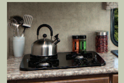
3 Burner range with Piezo ignitor