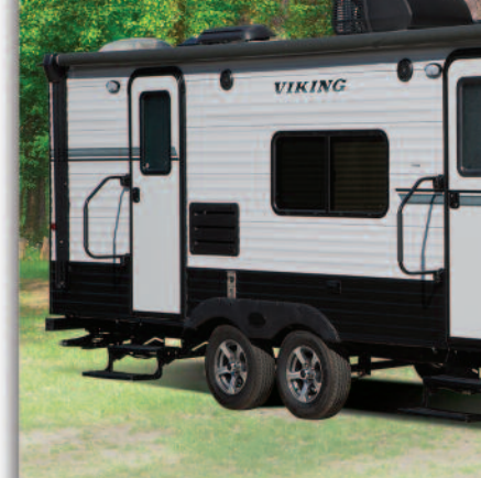
Designed for the 5000# tow class, the Viking 7'6" wide series is the perfect combination of features, quality and towability.