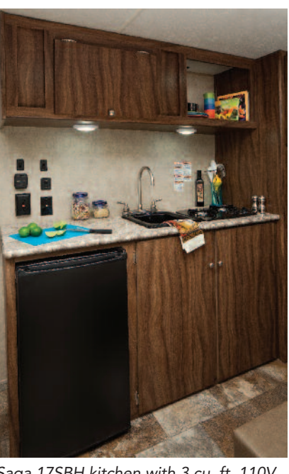
Saga 17SBH kitchen with 3 cu. ft. 110V refrigerator and loads of storage