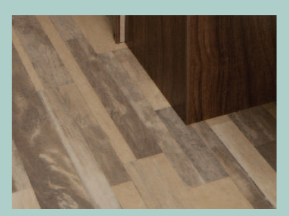
Congoleum residential grade Diamondflor with 100% adhesion combines beauty and durability