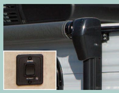
Standard power awning