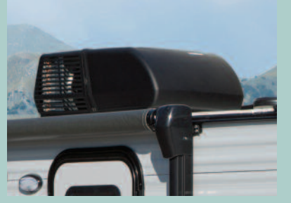
13,500 BTU air conditioner