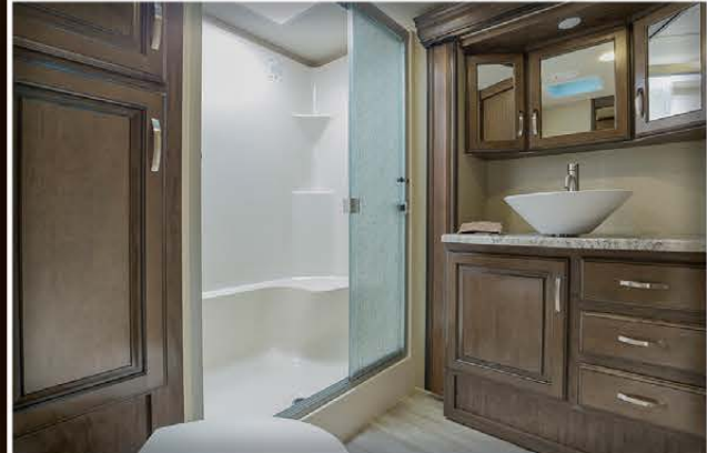
The bath area has modern appeal with a vessel bowl sink, designer faucet, and generous sized shower with seat. (384GK shown)