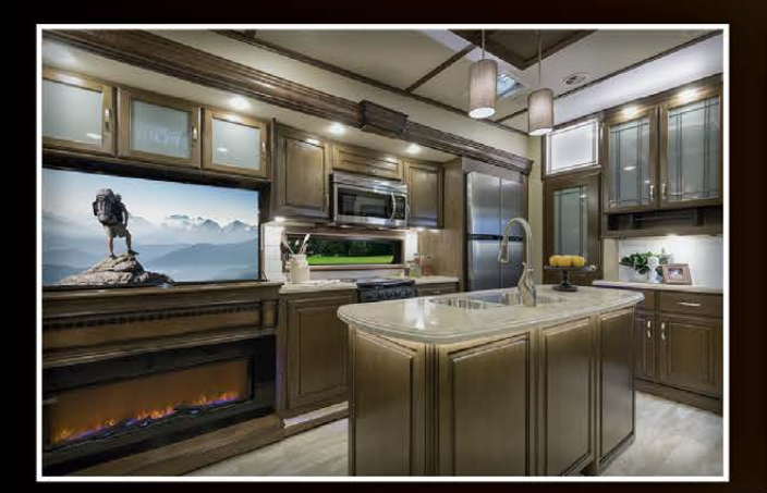
Surround yourself in the luxury of solid surface countertops, flush range and sink covers, stainless steel appliances, residential fixtures, and hardwood cabinetry. (310GK shown)