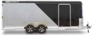
Shown with optional dual color.

Great looking Featherlite bumper pulls are affordable and compact and can be hauled by a wide selection of vehicles including SUVs and motorhomes. Custom workshops, living quarters and cabinetry are available as options in Featherlite's enclosed models.