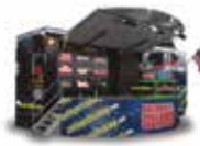
Mobile Display Trailer Take products to your customers