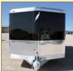
Bumper pull aerodyne nose