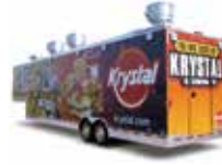
Mobile Kitchen Trailer Go on site with a mobile marketing trailer