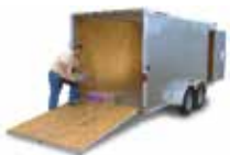
Model 1610 Rec/utility trailer to haul all types of cargo

For more information on the Featherlite Full Line of Trailers, visit www.fthr.com