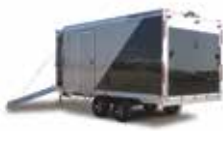
Model 1648 bumper pull snowmobile hauler