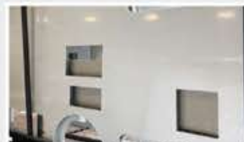
TALON GEL COAT GLASS FUSED FIBERGLASS WITH COMPOSITE BACKER