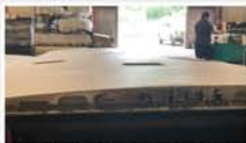
ONE PIECE WRAPPED FIBERGLASS ROOF NO SEAMS FROM FASTENERS ON RADIUS