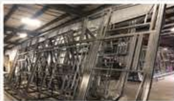
HSLA - HIGH STRENGTH LOW ALLOY STEEL 72% STRONGER THAN ALUMINUM