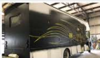
SHERWIN WILLIAMS RV SPECIFIC PRIMER, PAINT AND CLEAR COAT NO FLAKING OR DRIPPING