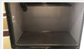
GALVANIZED STEEL STORAGE COMPARTMENT WITH RUBBER STORAGE PROTECTION FOR YOUR PERSONAL ITEMS

All sidewalls, floors and slide pieces are vacuum bond laminated and constructed with high strength low alloy steel. We surround every opening with HSLA. HSLA is a type of alloy steel with low carbon content which provides superior mechanical properties and resistance to corrosion.