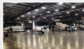
FULL CAMPING SIMULATION YOUR UNIT IS WORKING BEFORE THE DEALER RECEIVES IT