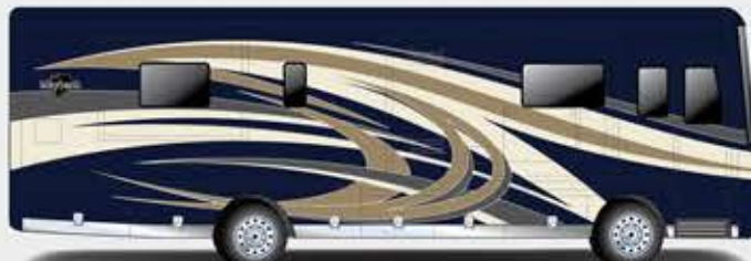
BLUE & GOLD