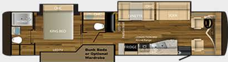
MAYBACH 37M | SLEEPS 8