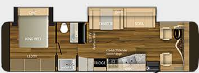
MAYBACH 32M | SLEEPS 6